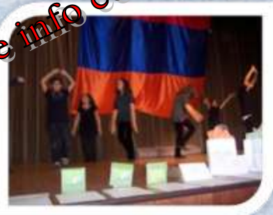
Armenian Dance Class