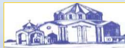
St. John Armenian Church