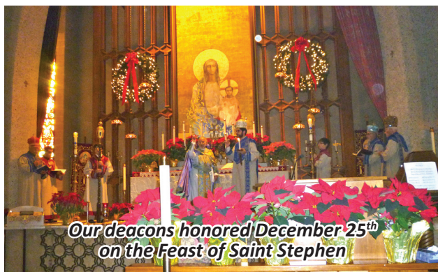
Our deacons honored December 25 th on the Feast of Saint Stephen

Please continue reading within for holiday celebration details: Women's Guild Advent by Candlelight and Western Christmas Eve worship service.