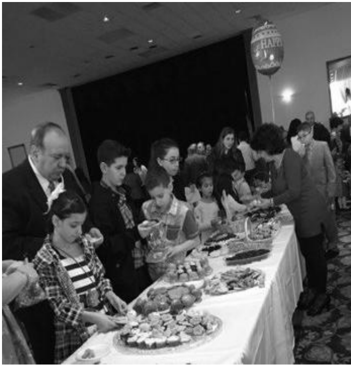
The entire congregation enjoyed the Easter Tea hosted by the Women's Guild. Our dedicated members provided a bountiful and beautiful buffet of cheese, fruit, colored eggs, and pastries.