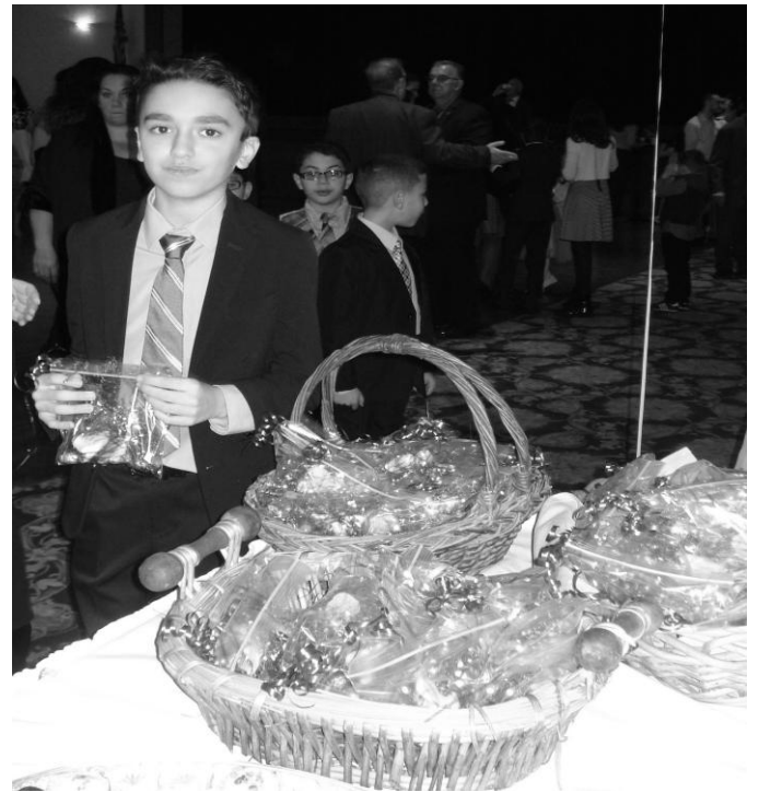
Special goody bags were prepared to the delight of the children.