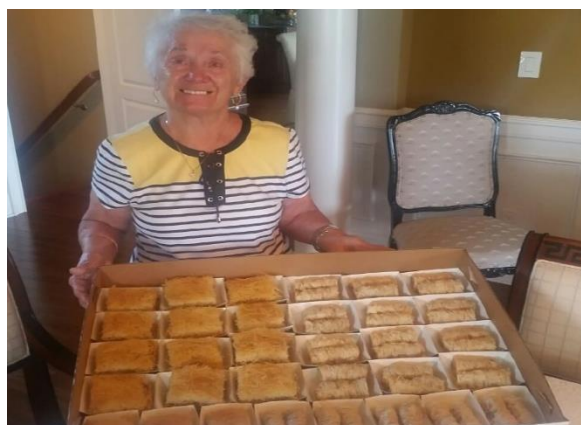
Picnic Bake Sale