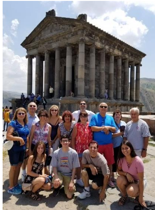
Fuller team builders at Garni Temple