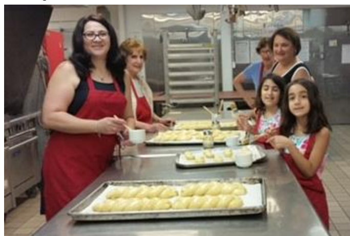
All genders and ages happily help with the Bazaar food preparation